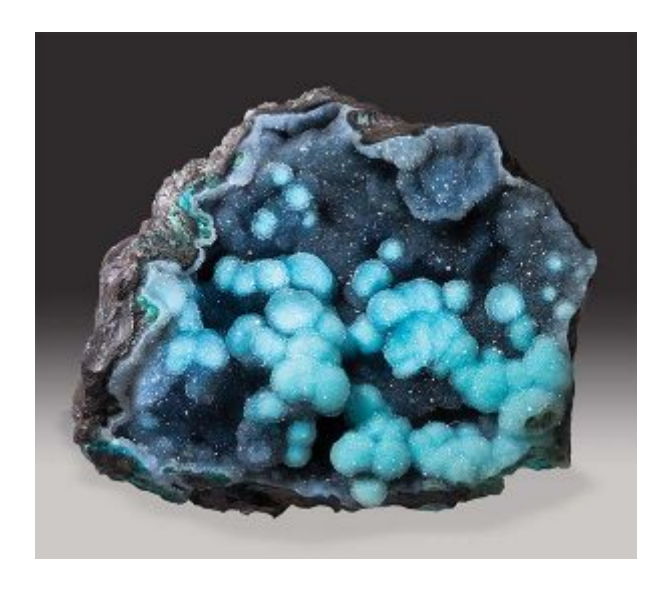
Quartz over chrysocolla, $7,500