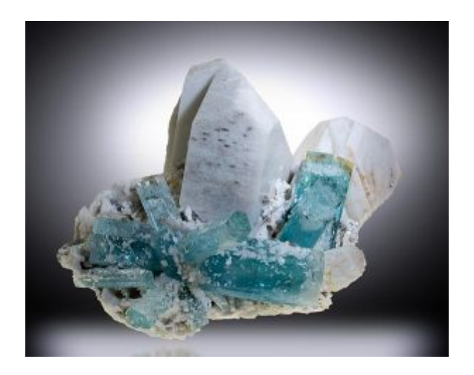
Aquamarine with orthoclase and manganotantalite inclusions, $295,000

Top: Liddicoatite tourmaline slice, $185,000