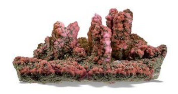
Rhodochrosite and chalcopyrite stalactites, $675,000