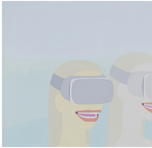
Olga Feshina: New Tech Girls-Bikini Issue at NYA & Gallery 104 in Tribeca July 04 - July 21, 2019